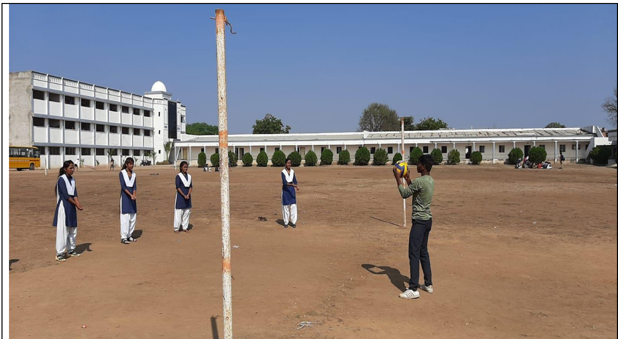
Photo 12: Boys & Girls participating in wholly ball practices in the campus