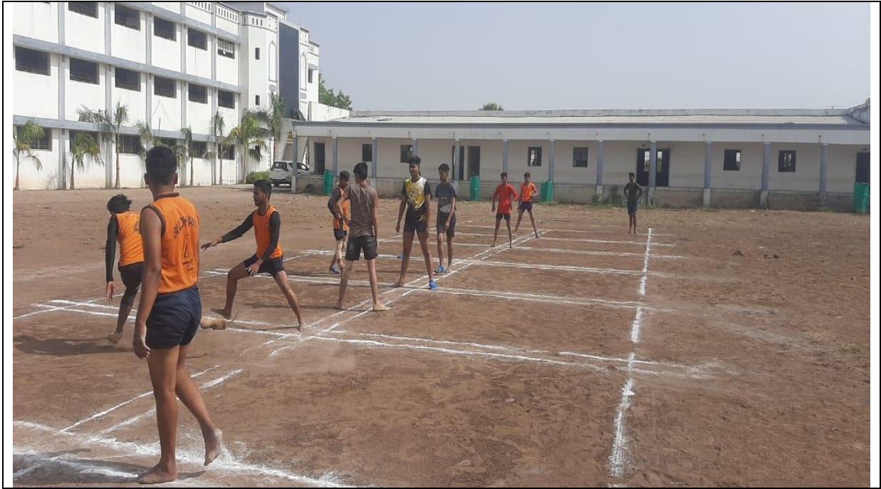
Photo 11: Boys participating in aatya patya practices in the campus