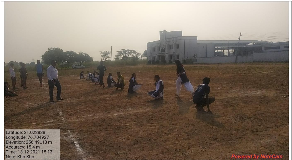
Photo 1: Girls students practicing kho -kho under the guidance of physical director