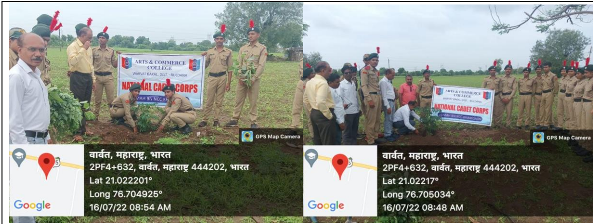
Tree Plantation 16.07.2022