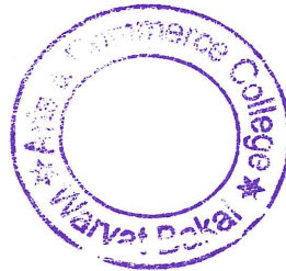
Principal Arts & Commerce College Warwat Bakal Dist. Buldana

This is to certify that the documents attached as supporting documents for Criterion VII: Institutional Values and Best Practices are verified from the college record and found to be correct to the best of my knowledge.