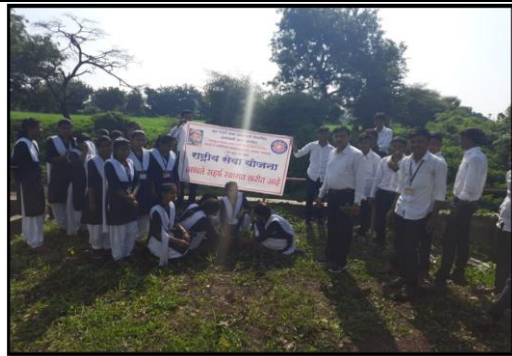
Seed Ball Dispersal 13.08.2022